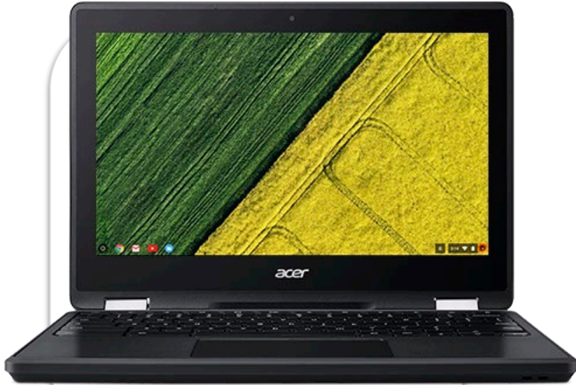
Acer Chromebook Spin R752TN-C1MT