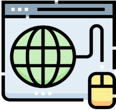
Harmful Online Content