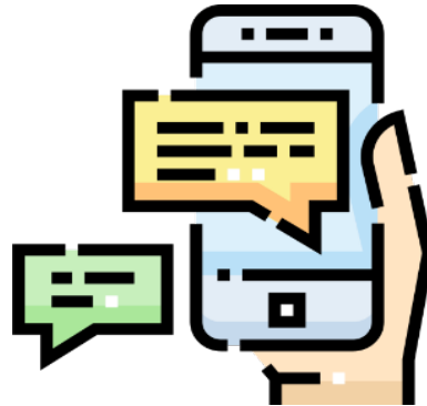
Distraction from Learning